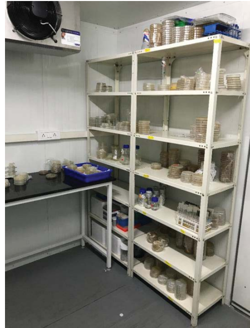
Cold Room Facility