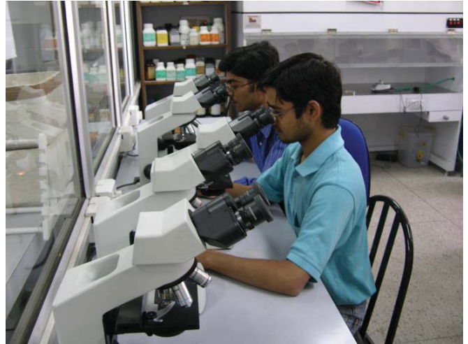
M.Sc. (Genetics) laboratory facility