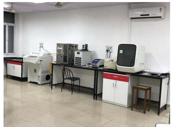
Real Time PCR