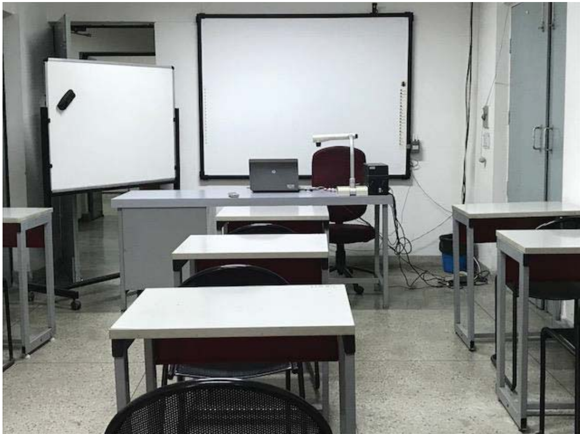
M.Sc. (Genetics) classroom with multimedia facility for interactive teaching