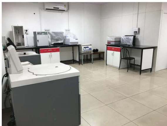
Microarray Hybridization Chamber