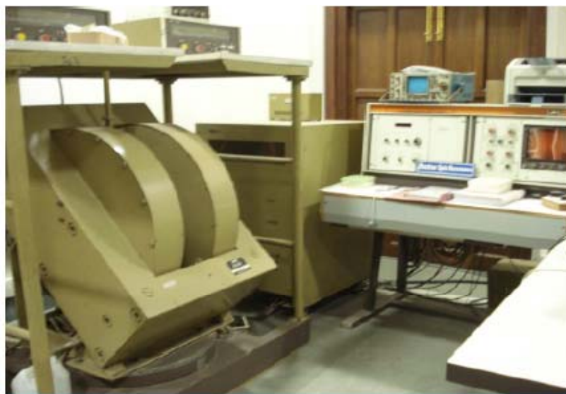
Electron Spin Resonance