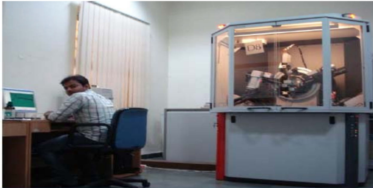
Bruker High Resolution X-Ray Diffractometer