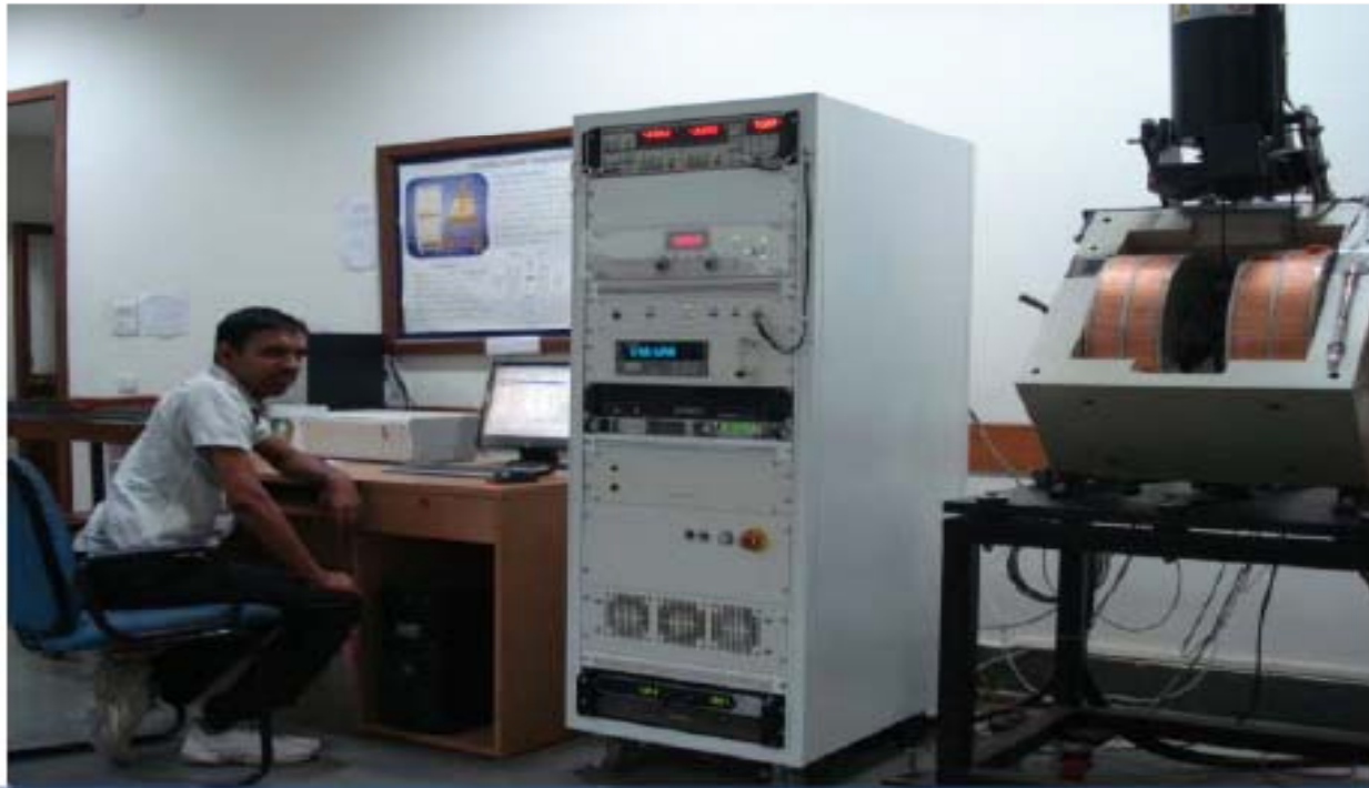
Vibrating Sample Magnetometer