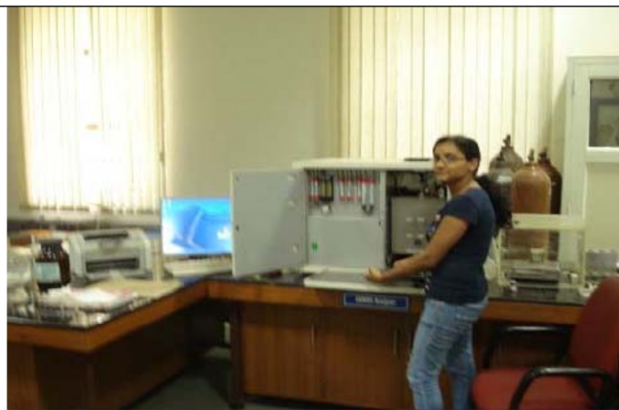
Elementar CHNSO Analysis