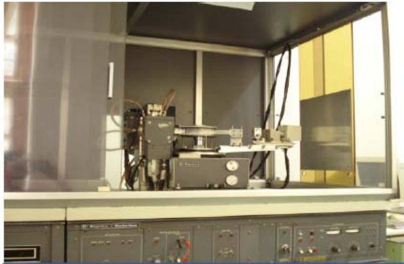
Rigaku Rotating Anode X-Ray Diffractometer