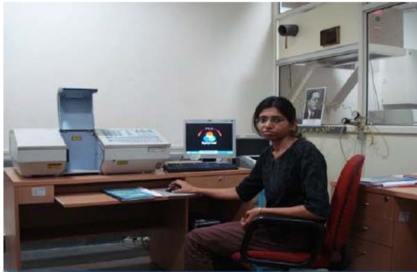
Perkin Elmer FT-IR