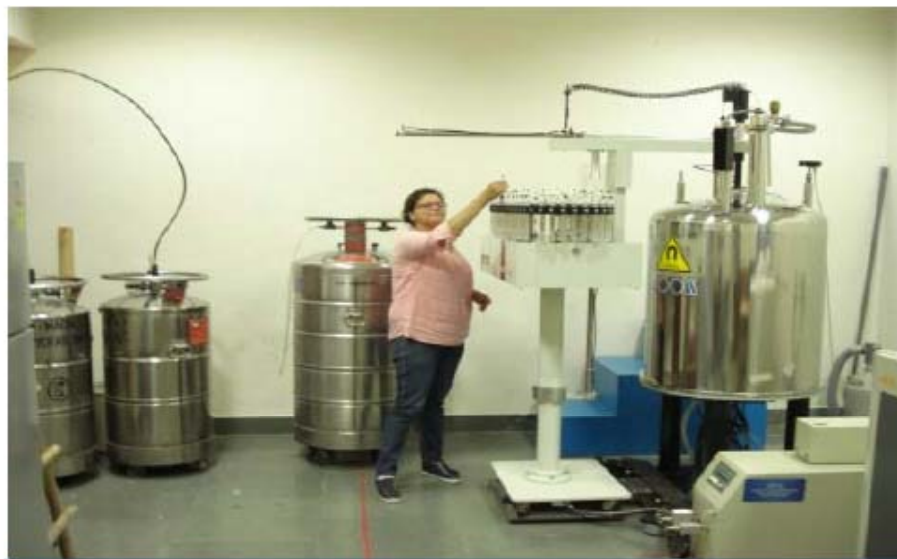
Jeol Nuclear magnetic Resonance (400 MHz)