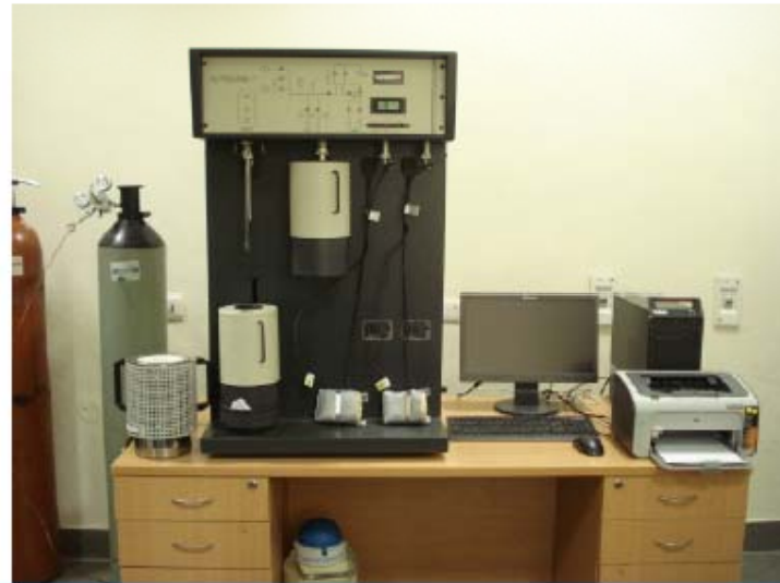
BET Surface Area Analyzer