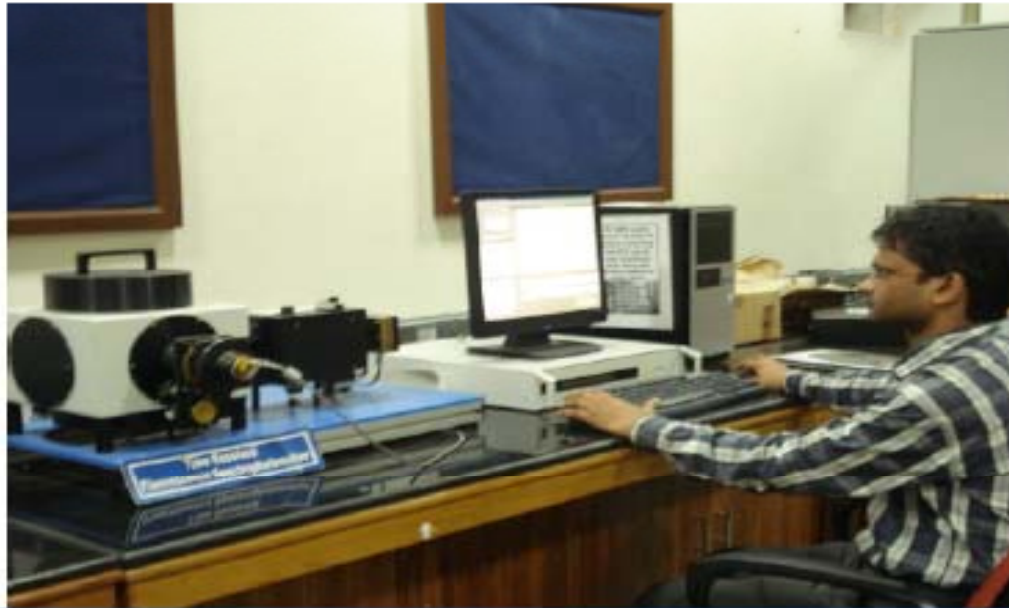
Time resolved Fluorescence