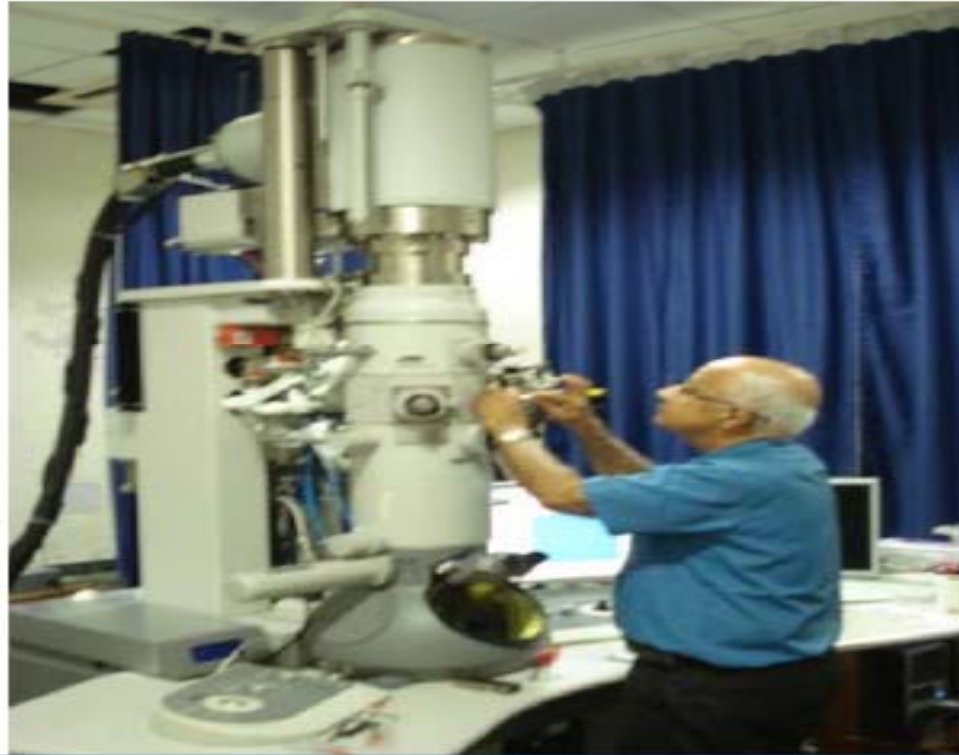
FEI Transmission Electron Microscope (300KV)