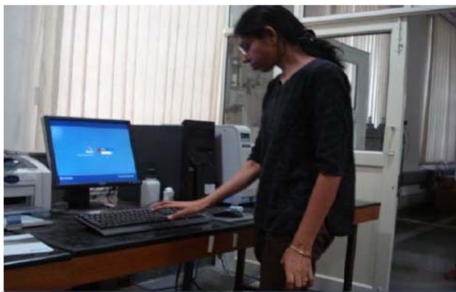
Perkin Elmer DTA/TGA/DSC