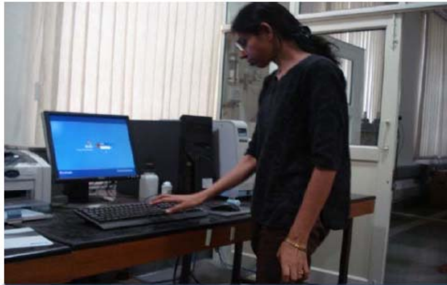
Perkin Elmer DTA/TGA/DSC