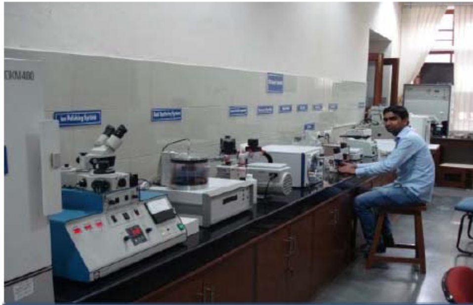
TEM sample preparation