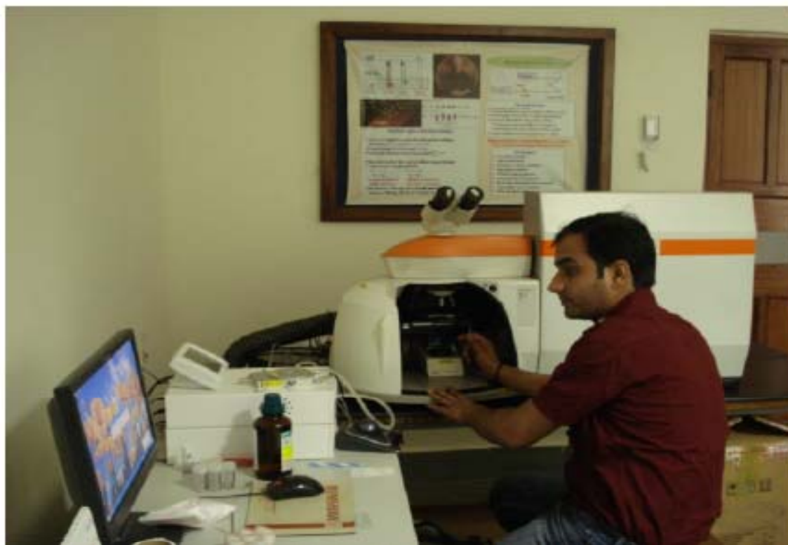
Laser Raman spectrometer