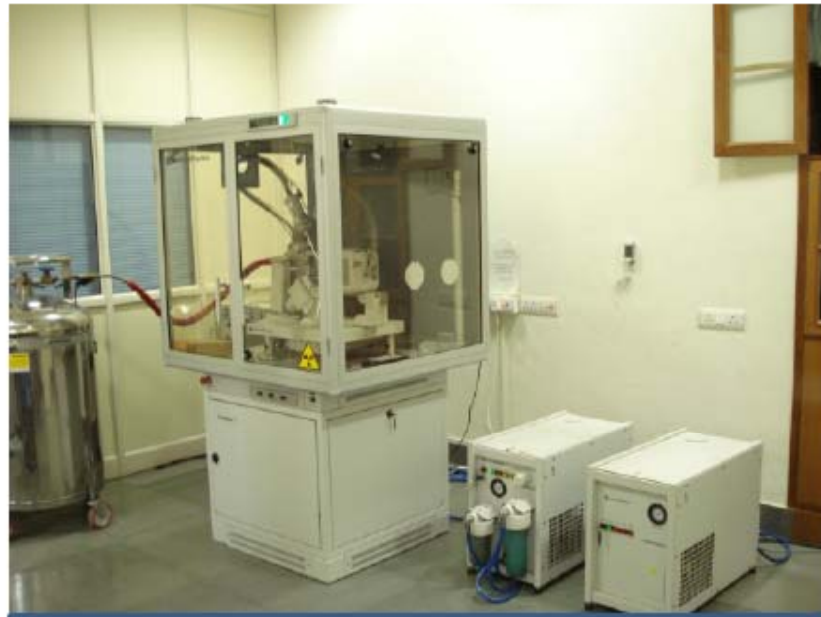
Single Crystal X-Ray Diffractometer