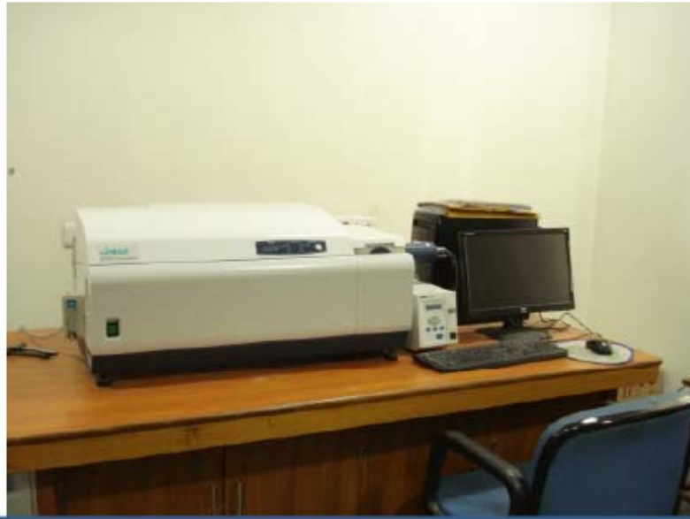
Circular Dichroism spectro polarimeter